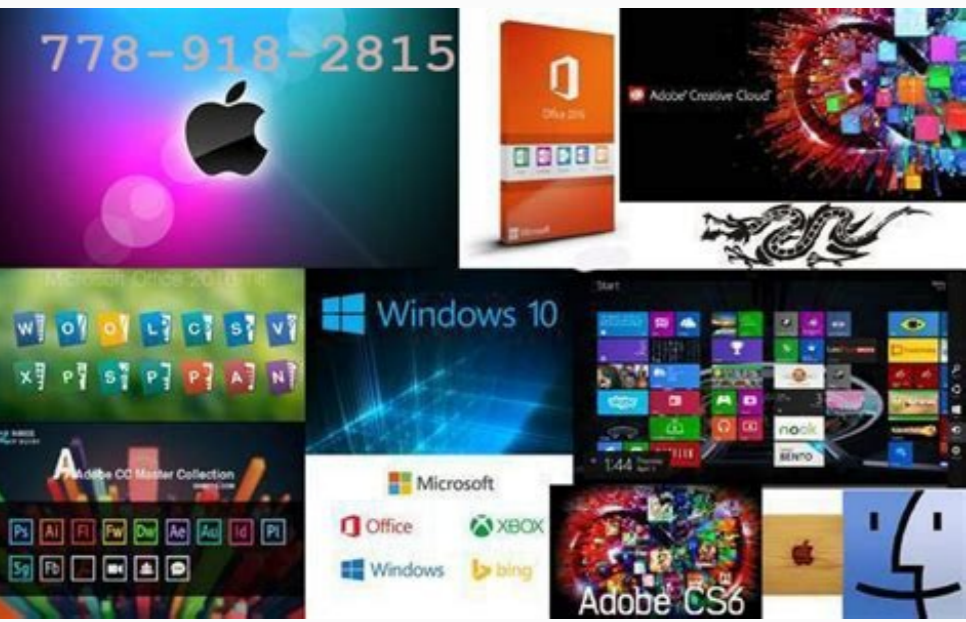
Micro graphics designer for windows 10. Multimedia designer vs graphic designer. Can a graphic designer be a product designer.